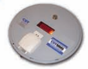
MMS (Medication Management)